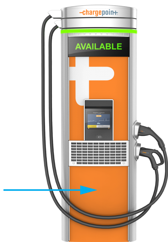
EXPRESS 250 and EXPRESS PLUS