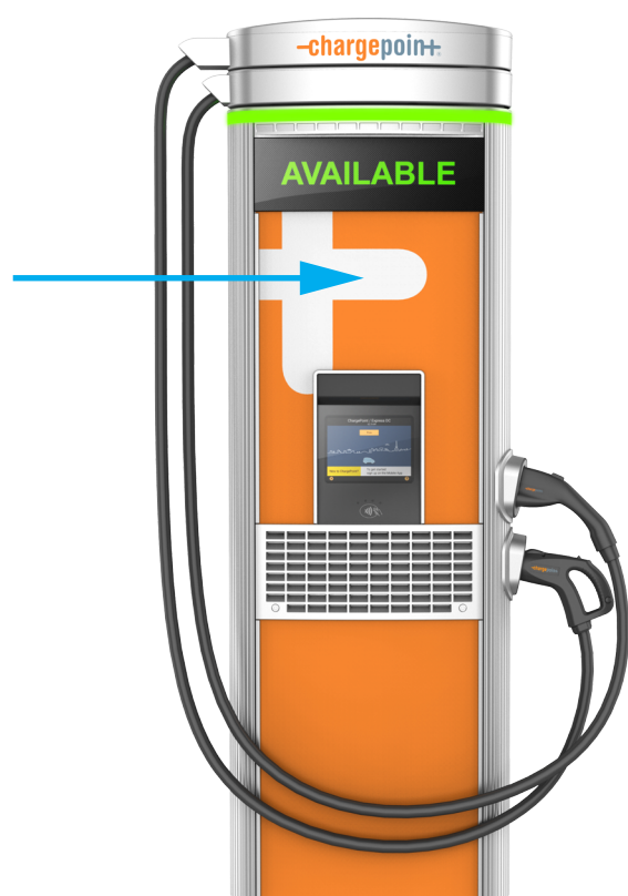
EXPRESS 250 and EXPRESS PLUS